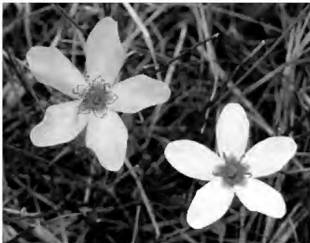
Figure 11. Sea pink ( Sabatia stellaris ).

Eric kindly stopped along a roadside while en route back to Riverhead, to afford me the opportunity to see and photograph weeping lovegrass and the beautiful little sheep's-bit (Figure 13), the latter in peak bloom. Both of these species were also new to me.